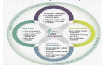
The 4 Domains for Rapid School Improvement

Our School vision is to prepare every student to become a productive member of society by providing them with a successful educational journey within a safe and stimulating environment, while allowing parents to be engaged in daily school activities.